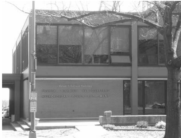
CAC meetings are held at 4th District Headquarters

Its meetings are very informative. Guest speakers are invited regularly and in the past have included members