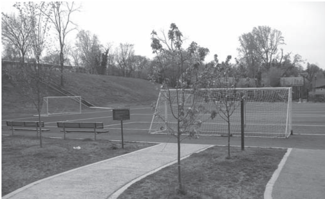
Shepherd Park Playground

The new and improved Shepherd Park and Field have been in place for over two years now. They have provided a fantastic place for neighbors to gather, socialize, and play. Children love the playground, adults appreciate the picnic shelter and tables, the soccer field is frequently used, and the exercise equipment and jogging track have been a real treat. The DC Department of Parks and Recreation (DPR) maintains the space and is responsible for renting out the picnic shelter in the playground area, as well as the field.