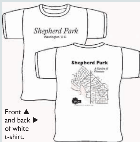
Front ▲ and back ► of white t-shirt.

We’ve just received our new stock of Shepherd Park t-shirts. The short sleeve 100% cotton shirts are available in white with green lettering and kelly green with white lettering. Adult (S-M-L-XL-XXL, $15/$12 for SPCA members) and youth (S-M-L, $12/$10 for SPCA members) sizes available. Call Angela Martin at 723-0323 to get yours. Free delivery in the SPCA membership area!