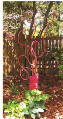
Flamingos , by Tom Noll