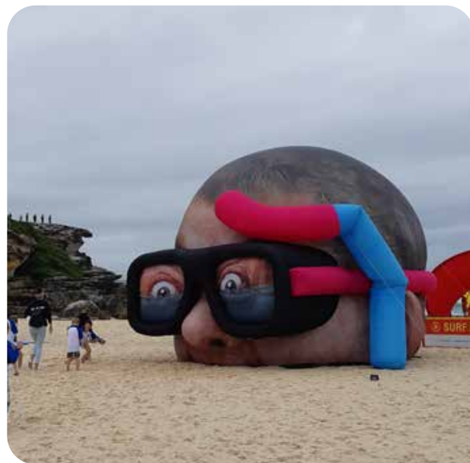
Sculptures by the Sea.