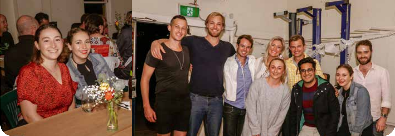
Fun for all at the Tamarama Annual Awards Night.