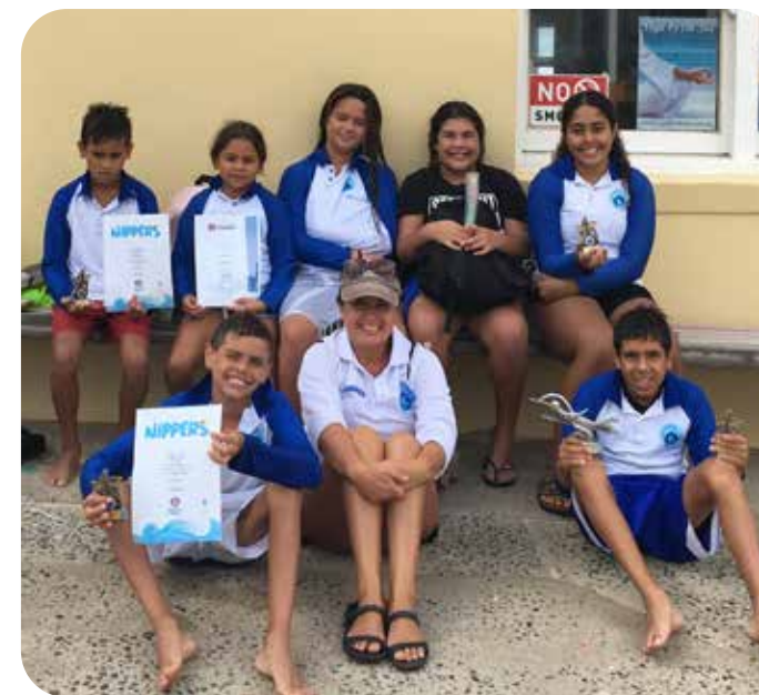
2018/19 participants of the Holly Days program.