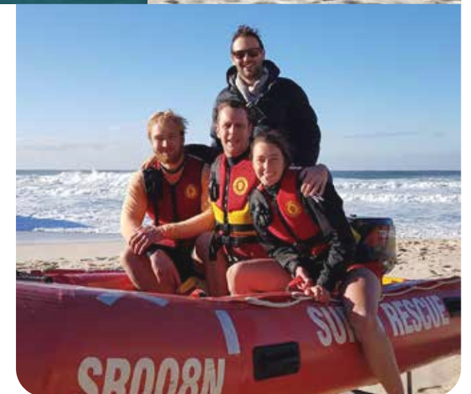
Top: A Tamarama patrol enjoying the sunshine.