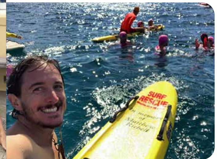
Bronzie training on way to Bondi.