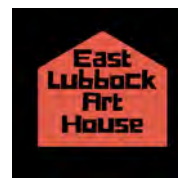
East Lubbock Art House Lubbock, TX