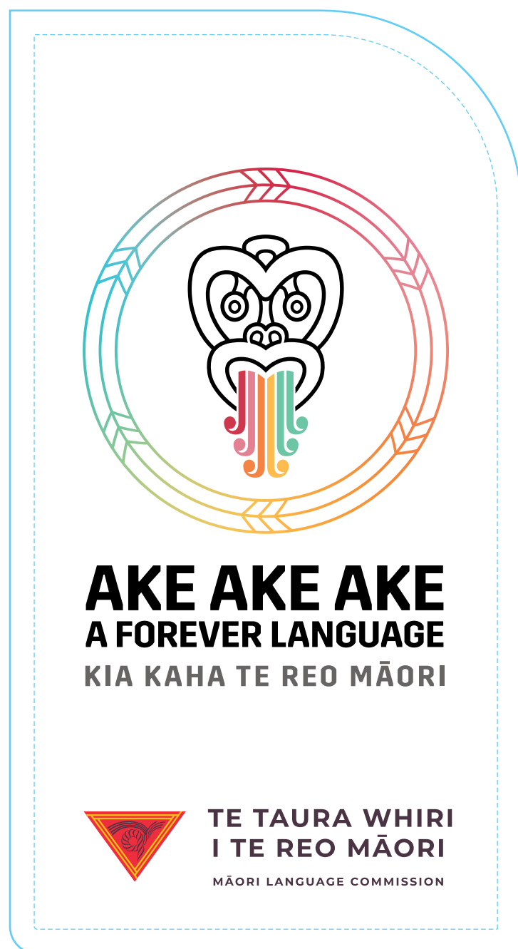
Standard Flagtrax LEFTHAND SIDE

950mm x 1750mm finished size 1000mm x 1800mm with bleed