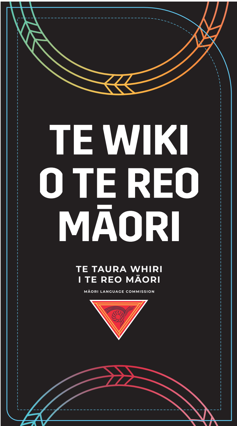
Standard Flagtrax LEFTHAND SIDE

950mm x 1750mm finished size 1000mm x 1800mm with bleed