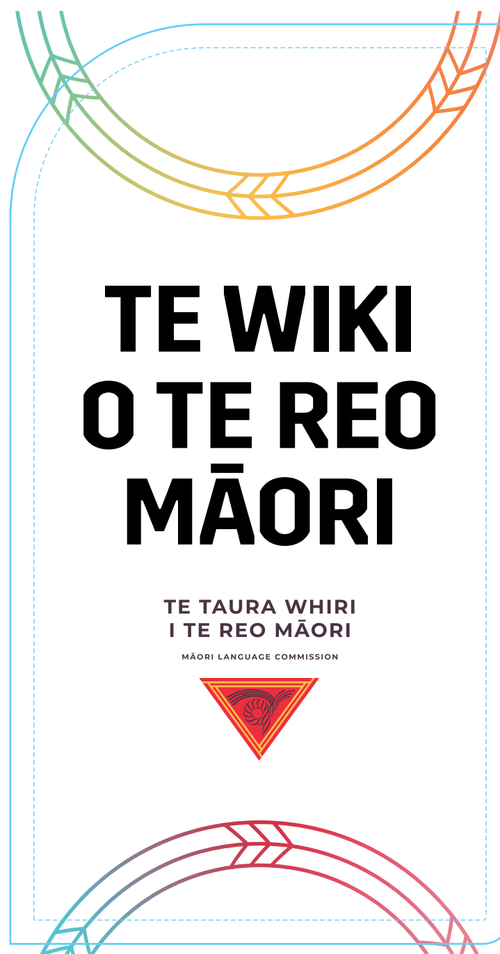
Standard Flagtrax RIGHT HAND SIDE

950mm x 1750mm finished size 1000mm x 1800mm with bleed