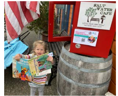
Pictured: An eager child engages with the Little Free Library in Point Roberts (Whatcom County) with ILWA flyer and book kit.

Department of Corrections to uplift literacy opportunities within state correctional facility visitation centers, providing children reading and connection opportunities with incarcerated loved ones. A national pilot collaboration has also taken flight via ILWA's partnership with Little Free Library (LFL) with installation of QR code flyers and Imagination Library books within individual LFL houses across the state, further amplifying book access.