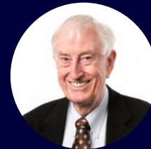
Patron Nobel Laureate Professor Peter Doherty, AC FRS FMedSci