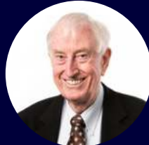
Patron Nobel Laureate Professor Peter Doherty, AC FRS FMedSci