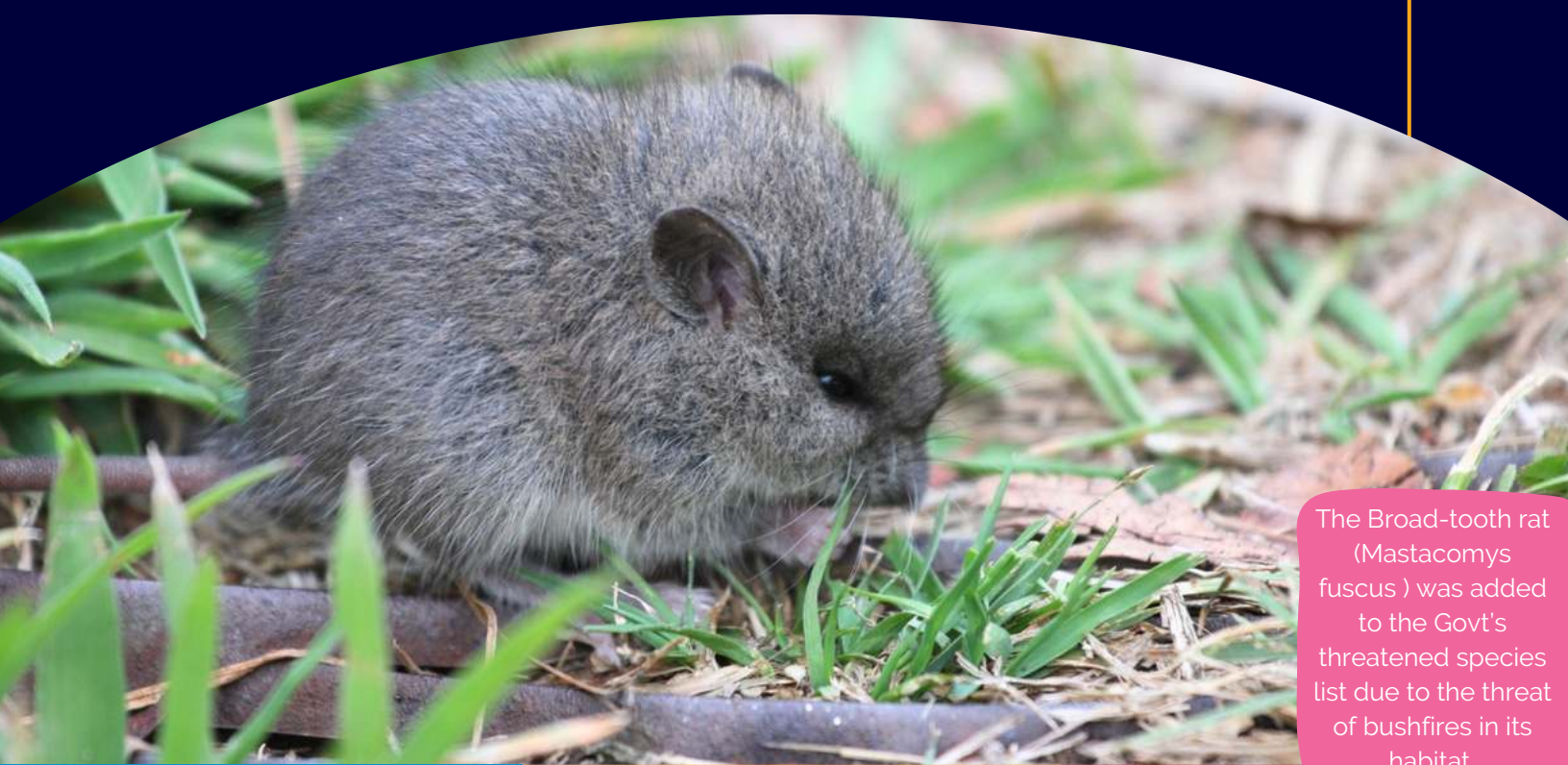
The Broad-tooth rat (Mastacomys fuscus) was added to the Govt's threatened species list due to the threat of bushfires in its habitat