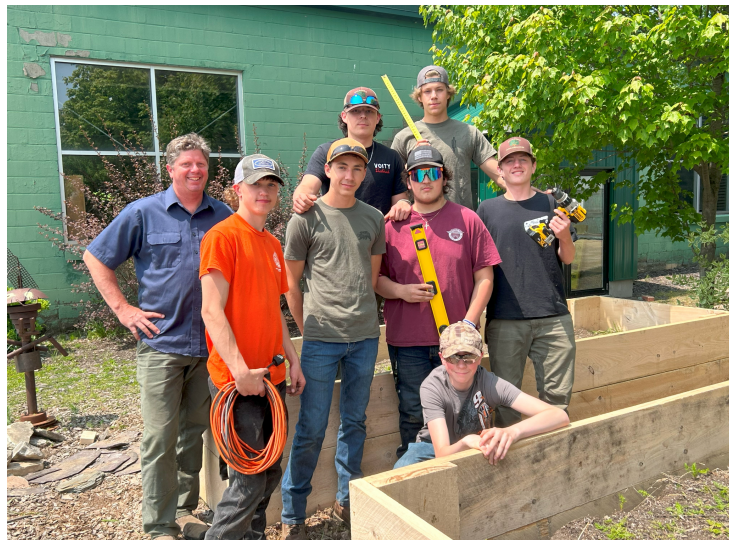
Youth volunteers from