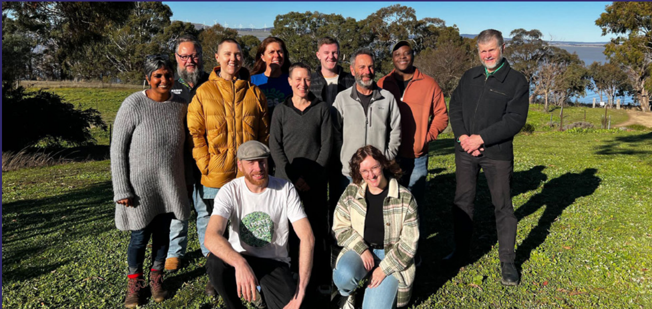
The RE-Alliance staff team in July 2023.

RE-Alliance, or the Renewable Energy Alliance, is an independent not-for-profit working to secure an energy transformation that delivers long-term benefits and prosperity for regional Australia.