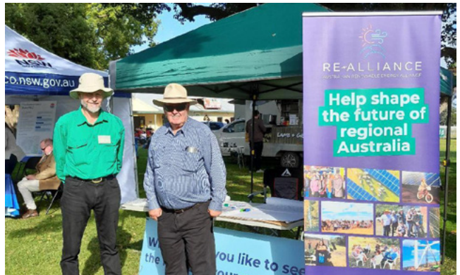
Top: Community meeting with government in Dubbo, February 2023.