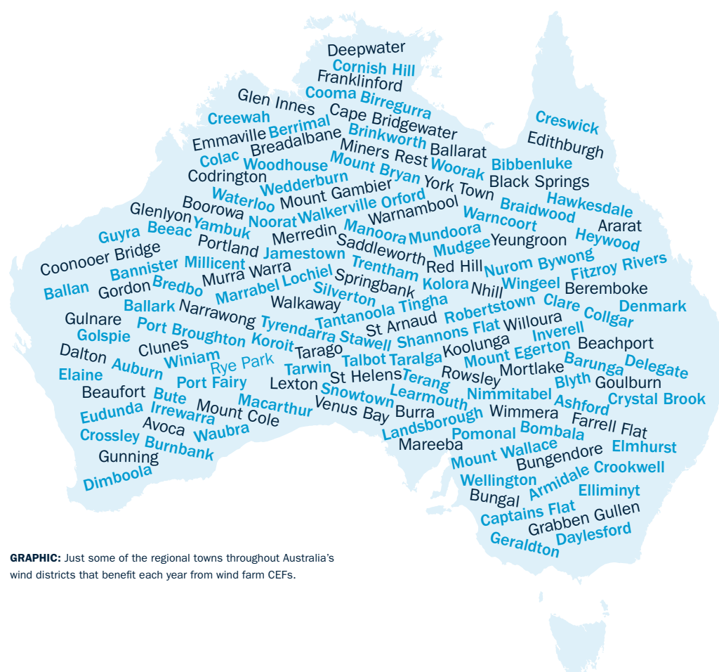
GRAPHIC: Just some of the regional towns throughout Australia's wind districts that benefit each year from wind farm CEFs.

These types of contributions have shown that the best outcomes are most often reached through good communication and collaboration between projects and communities.