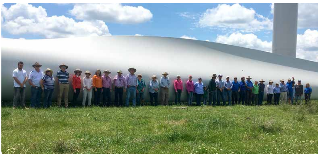
PHOTO: Sapphire Wind Farm Landholders visit construction site. © CWP Renewables.

There are several hundred farmers across Australia who now enjoy annual payments over a 25-year life span of a typical wind farm. That's a big boost to the resilience of a lot of rural towns and businesses who have to struggle year to year with the ups and downs of agriculture.