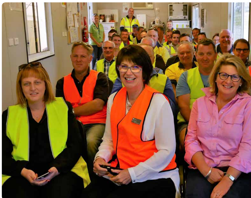
PHOTO: Vocational education teachers from across New England and North West NSW visit Sapphire Wind Farm.

A number of CEFs direct funds towards enhancing sustainability, such as the Clean Energy Program at Gullen Range Wind Farm and the Denmark Wind Farm Community Sustainability Fund. Others accept a broad range of requests, with geographical boundaries, grant size limits or other mutually agreed objectives and scope.