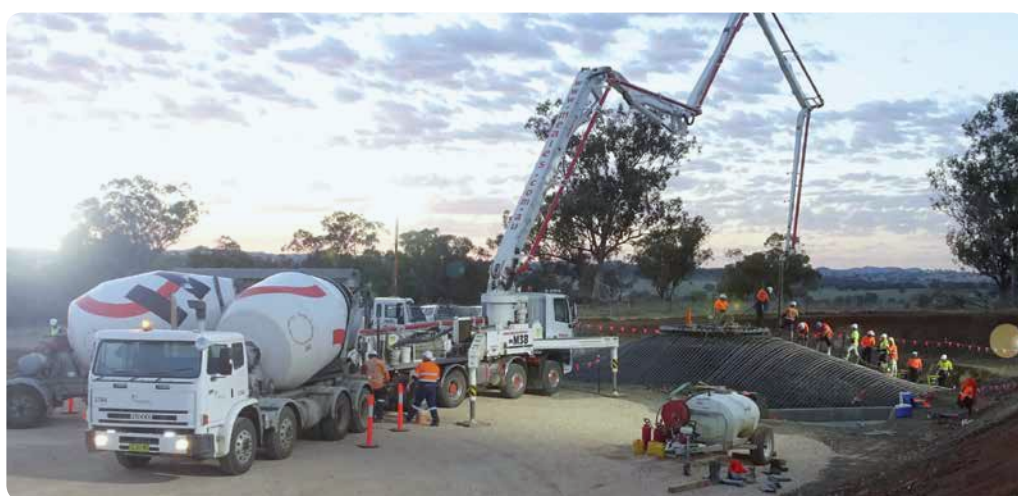
PHOTO: Turbine base construction, Bodangora Wind Farm.

With wind energy one of the cheapest sources of new power in Australia and with prices still coming down, 32 a sustainable wind industry can continue to grow beyond 2020, generating good jobs and contributing to diverse and thriving regional communities.