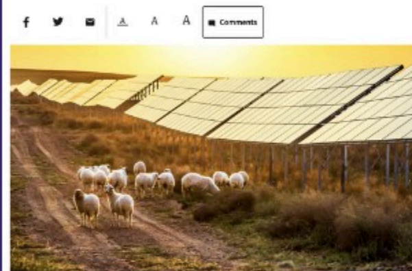
Sheep and solar panels make for quite the rural tableau.

For farmers who have taken up renewable technology, it doesn't matter if it is Barnaby Joyce or Michael McCormack in the top job - the federal Nationals