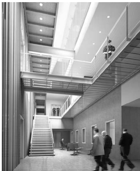
LAPD METROPOLITAN DIVISION FACILITY

Perkins+Will congratulates the City of Los Angeles Bureau of Engineering, LAPD, and our consultant team on the receipt of this Merit award. Special thanks to WUF.