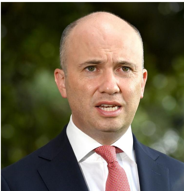
NSW Treasurer and Energy Minister Matt Kean.

“Clearly 95 per cent plus public opinion would be on the side of saying that a woman is a biological female, it's not optional or subject to self-identification,” he said.