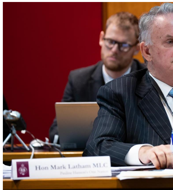
One Nation MP Mark Latham.