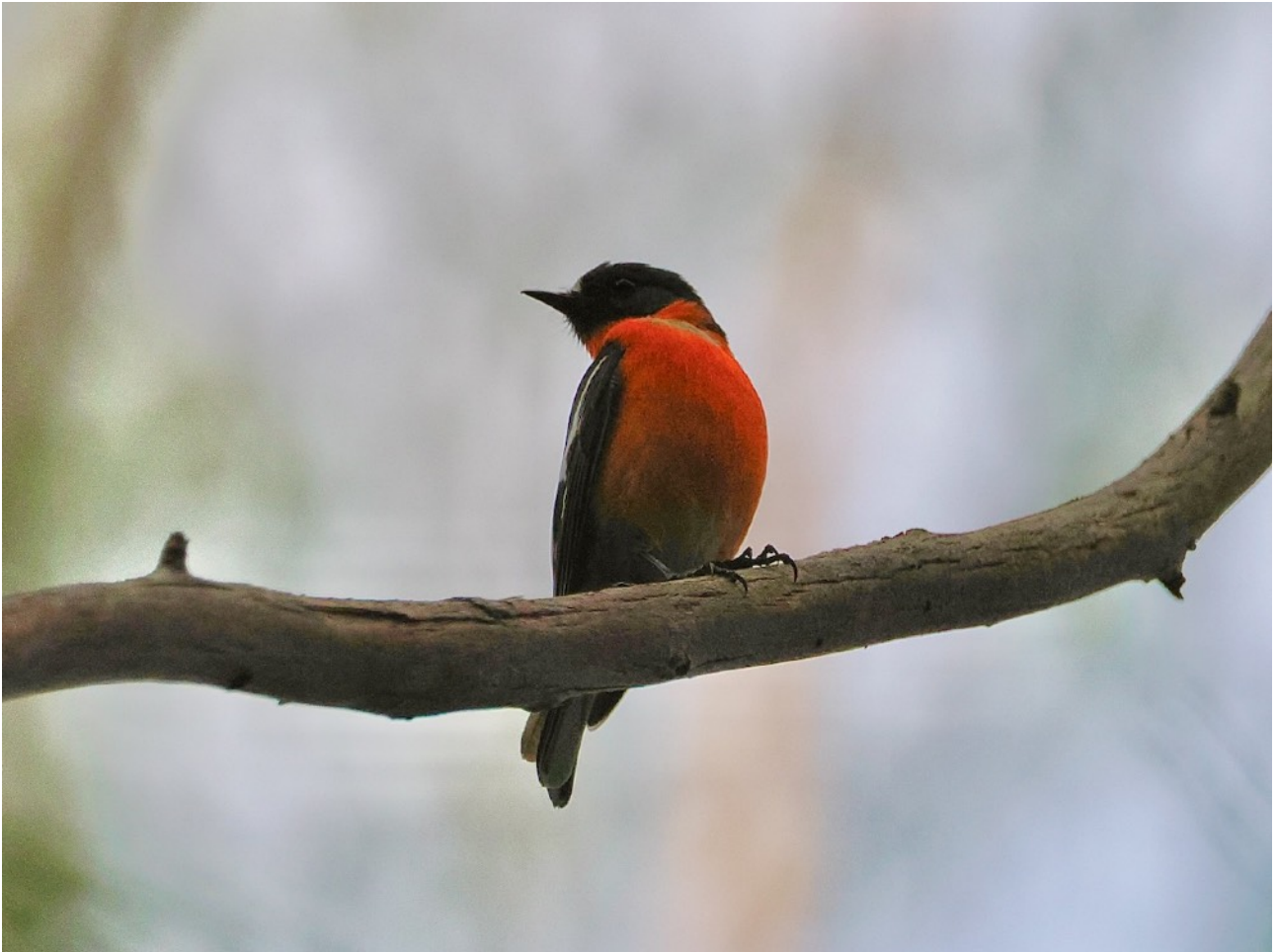
A flame robin within the proposed logging area.

Lead by Birdlife Southern NSW, citizen scientists have been searching for birds within the area proposed for logging. So far, a large number of apparent breeding pairs of flame robins have been found. Their nests receive an exclusion zone under the CIFOA, and although it is the wrong season to find them, we know they are there. There have also been several sightings of the nationally endangered gang-gang cockatoo, along with calls heard of both powerful owls and sooty owls - listed as threatened species in NSW.