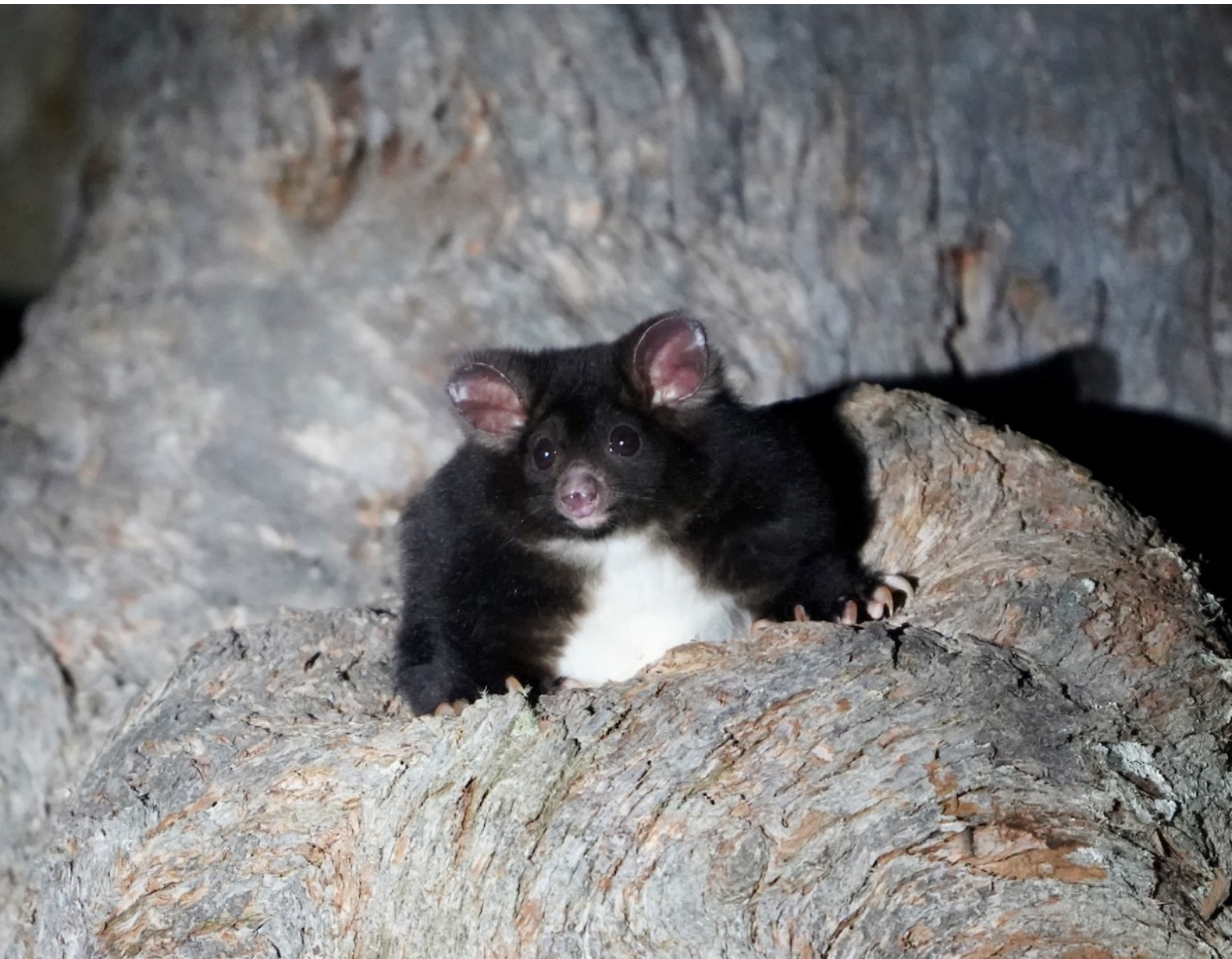
Greater glider exiting a den tree hollow at record 48.