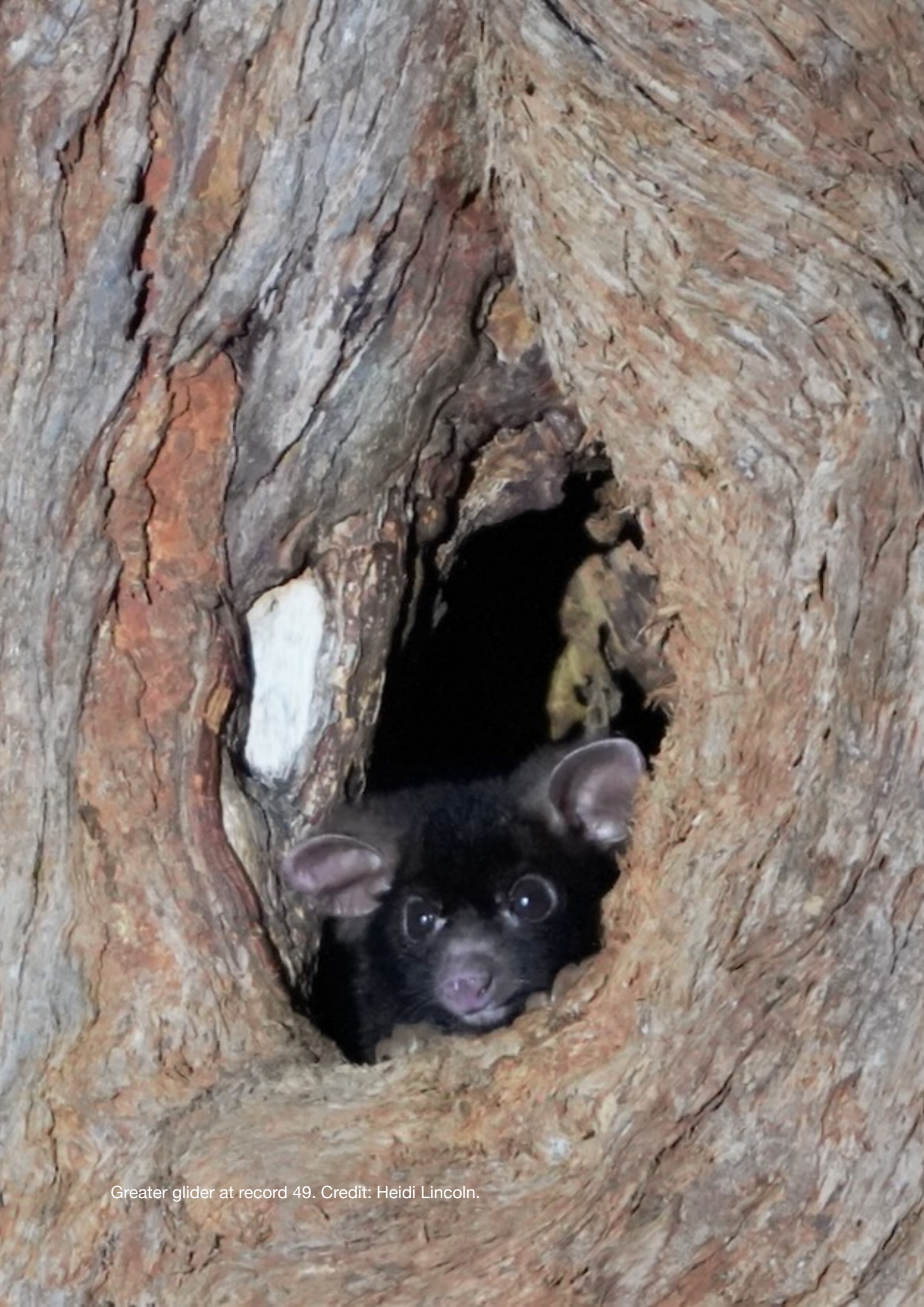
Greater glider at record 49.