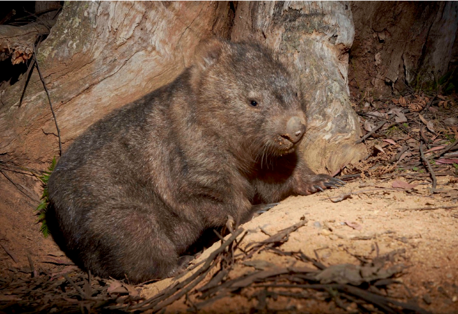
A wombat in the proposed logging area sits at its burrow entrance.

Those 666 records have been submitted to FCNSW by Jarake Wildlife Sanctuary separately.