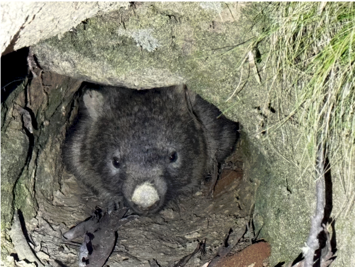
A wombat in its burrow in the proposed logging area.