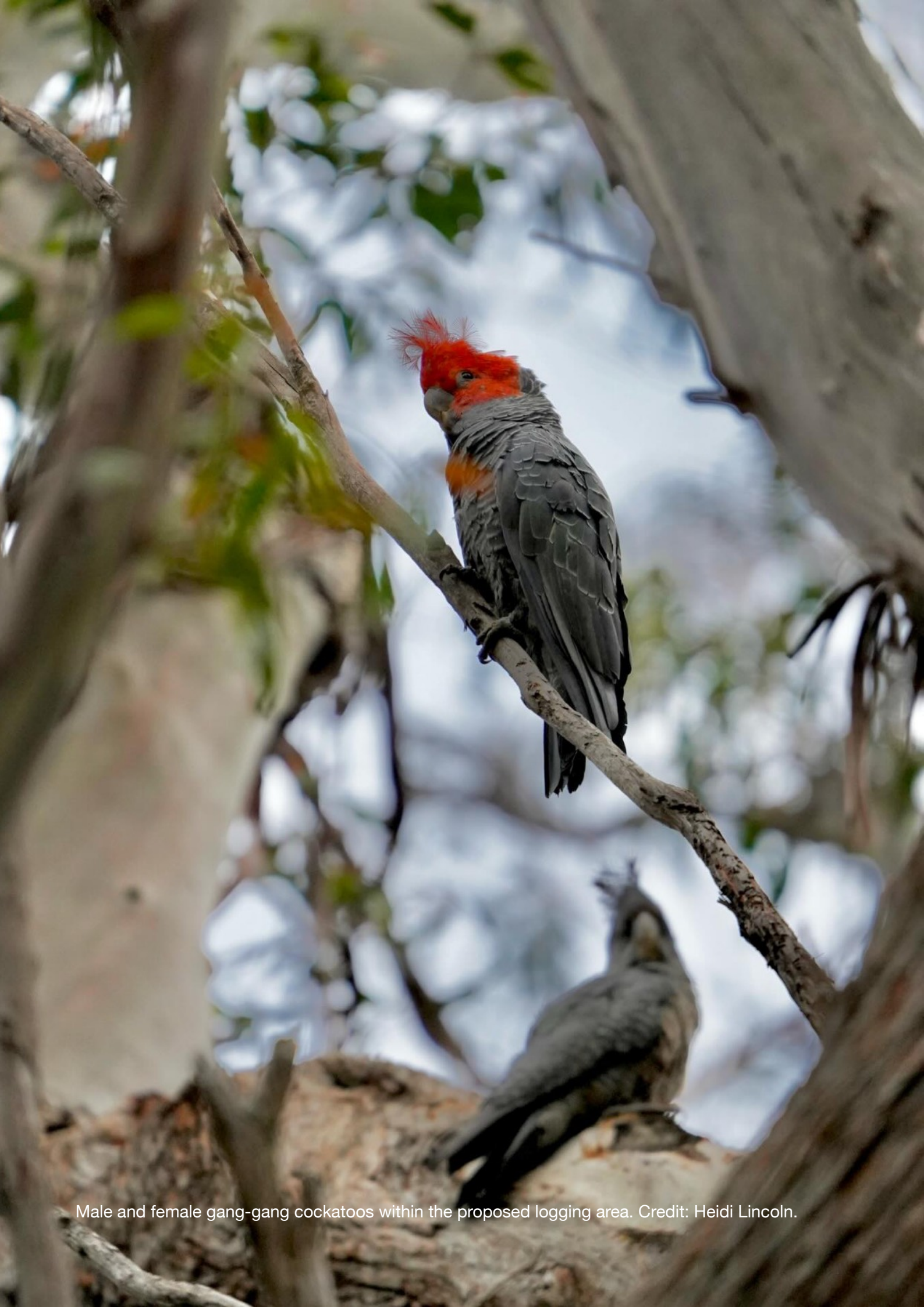
Male and female gang-gang cockatoos within the proposed logging area.