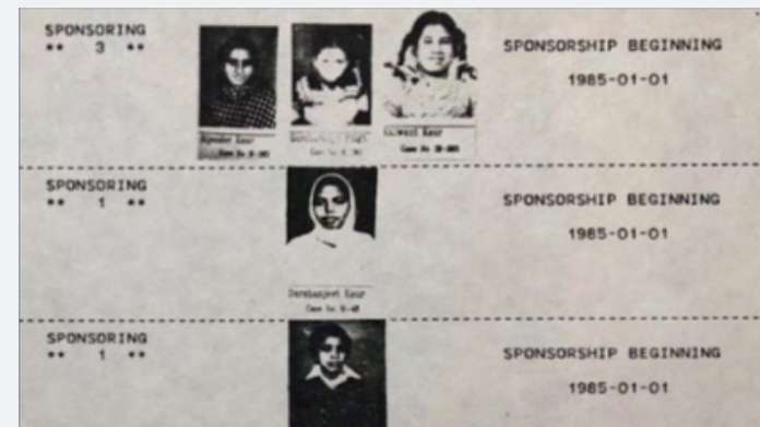
WSO Adopts Sikh Orphans