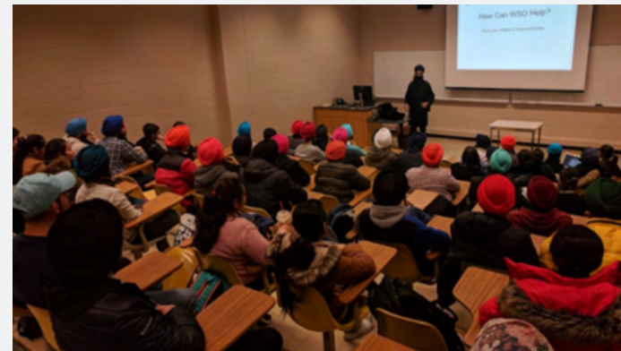
International Student Orientation Sessions