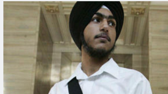
Multani Kirpan Case Goes to SCC