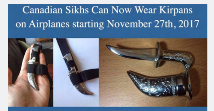
Kirpan Accommodation on Flights