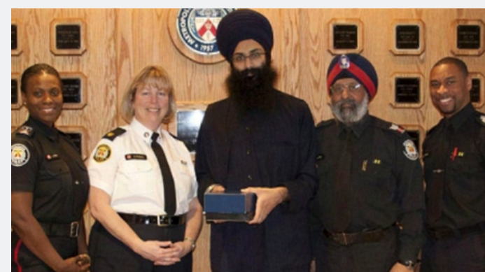
Training Module for Toronto Police