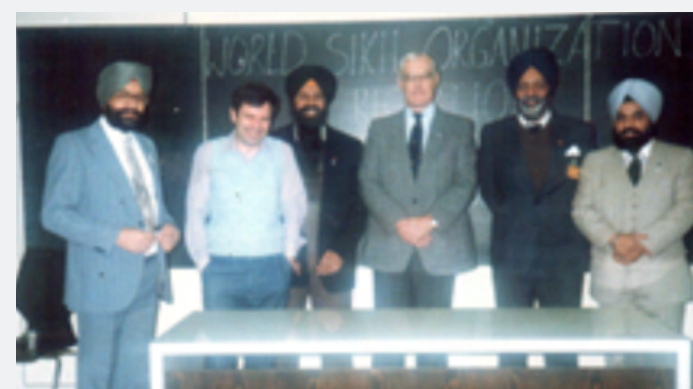
WSO Presents at the UN