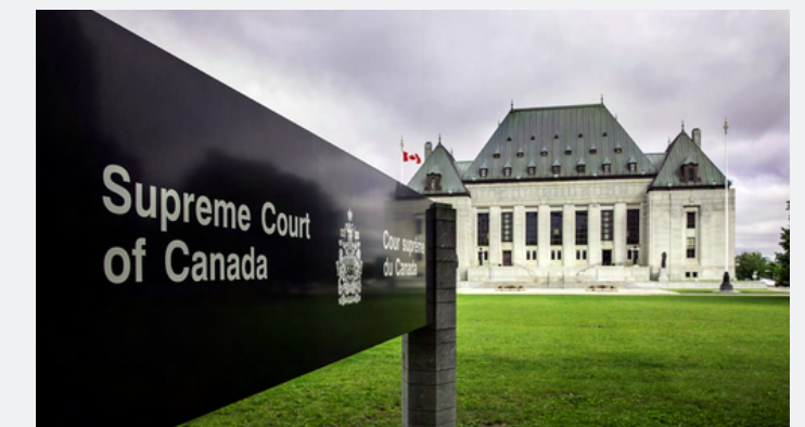
File Legal Challenge on Bill 21