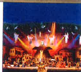
"MIRACLE OF CHRISTMAS" Show at Sight & Sound® Millennium Theatre®

Diamond Tours inc. Bringing Group Travel to a Higher Standard®