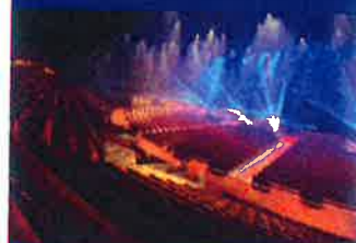
The Sight and Sound Theatre is State-of-the-Art