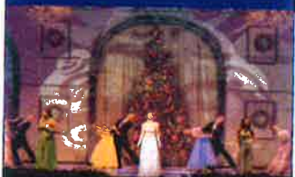
"THE FIRST NOEL" Show at the American Music Theatre