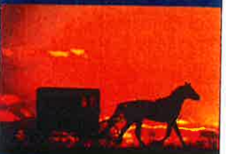
Experience the Amish lifestyle